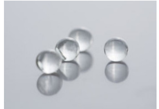
Figure 1: SiLibeads Type S glass beads [1]